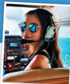
Wheels up: Enjoying a front row seat on a Wingly private charter plane